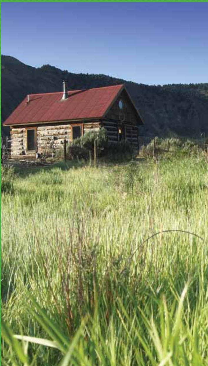
The original homestead cabin at Roundup River Ranch