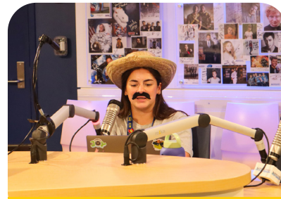
Hospital Howdy Hangout