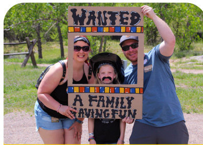
4 Mile Historic Park