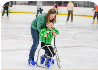
Roundup On Ice

The more times campers say “Howdy!” to each other, the more they get that happy feeling of belonging.